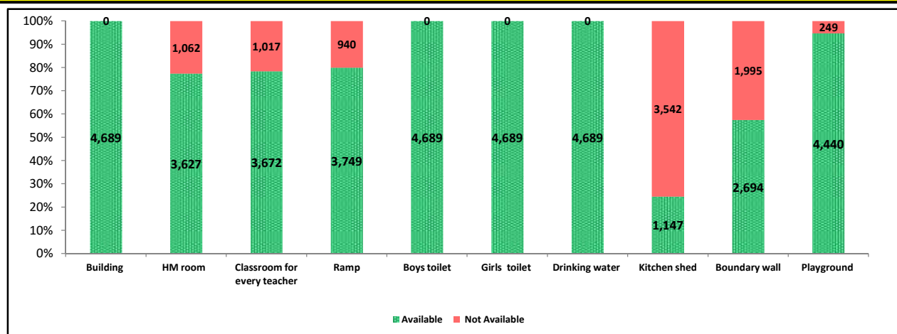
Status of Infrastructure Facilities in Schools (Numbers, All schools)